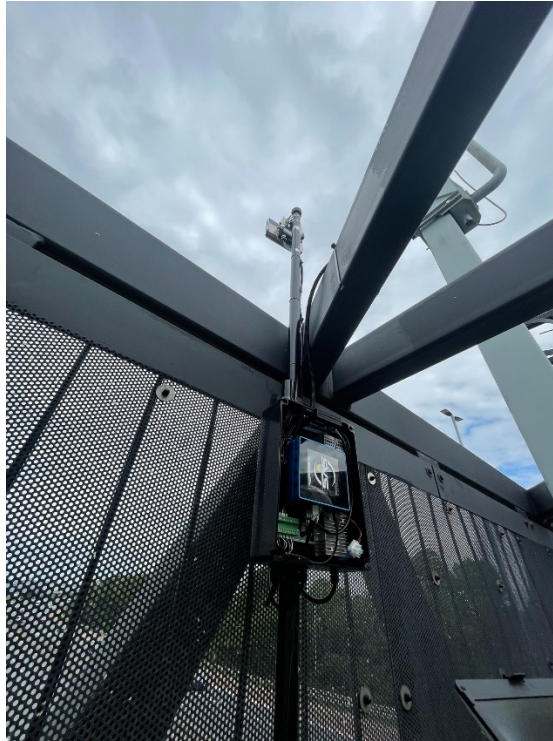
Fig 1: Showing TRUGRD STREAM radar installation on a pole extender above gantry walkway with the NOVUS unit installed below. The radar is installed at an overall height of 9.7m from carriageway.

Both radars were commissioned. One radar was directed northbound and the other directed southbound capturing the traffic data in each direction.