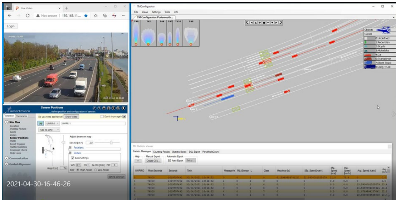
Fig 2: CCTV image M275 southbound from built-in camera in the radar with the object detection and classification and other data shown on the right. *Note the cycleway and walkway to the right of the image where the radar was also picking up pedestrian traffic and cycles.

The raw data leaving the radar is in a pseudo-hexadecimal format provided by smartmicro™ (via RS485 or port based via ethernet) and a video stream (via ethernet) to the NOVUS PREMIUM data aggregator developed by Smart Video & Sensing Ltd. Software in the NOVUS has been specially written within a Windows™ environment to interpret the hexadecimal output from the smartmicro™ radars to identify the data headers for relay outputs, per vehicle counting and other statistical data. The information drawn from the data aggregation and statistical analysis can then be used to provide the information about the data captured by the radar in other formats. Data is stored at the NOVUS on a removable data device or a hard drive to ensure that nothing is lost in the event of any communications breakdown and can be uploaded at any time in a .csv format, .xml format or passed to the Smart Video & Sensing Ltd cloud server or to a third party software application via an API or JSON file.