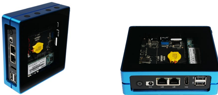
NOVUS PREMIUM DATA AGGREGATOR

Additionally, no direct communications were available at site, so the Novus unit was programmed for 3G/4G operation. The intention was to install an extension to the Portsmouth City Council 'mesh' system at that point soon and remove the requirement for the 3G/4G connection.